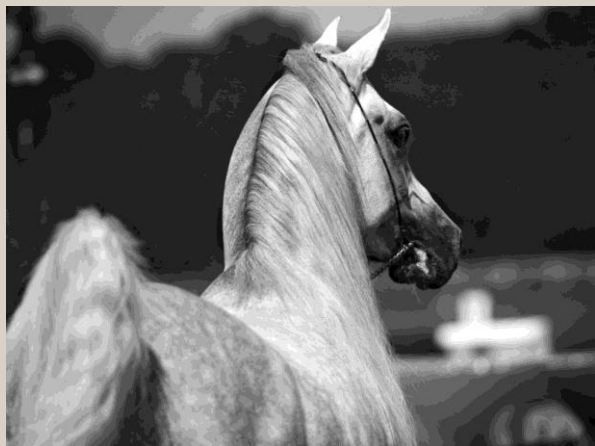
SHOWCASING THE MAJESTIC ARABIAN