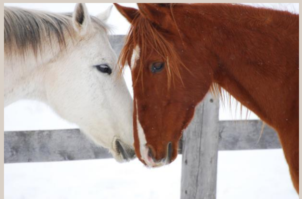
BUILDING LASTING RELATIONSHIPS