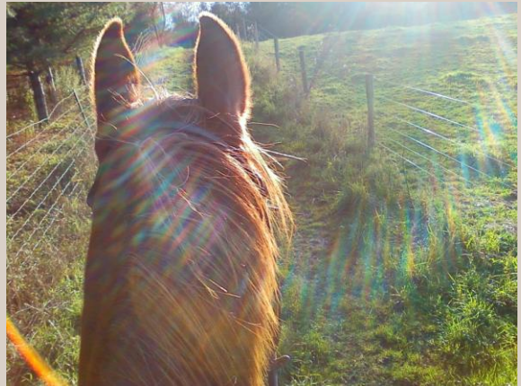
LOOKING TO OUR BRIGHT FUTURE